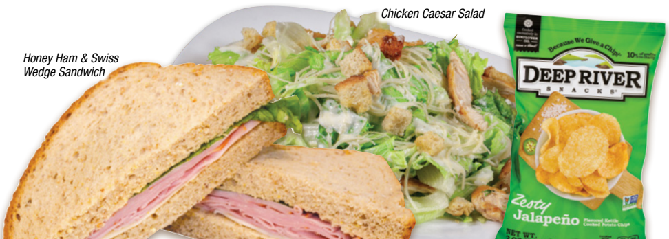
Chicken Caesar Salad