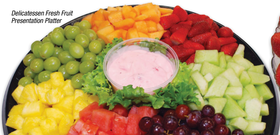
Delicatessen Fresh Fruit Presentation Platter