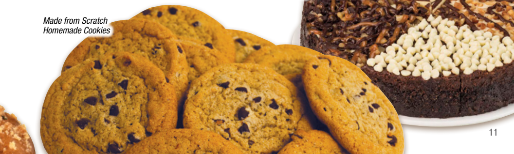
Chocolate Lover's Sampler Cheesecake