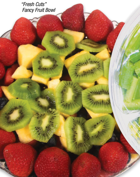
“Fresh Cuts” Fancy Fruit Bowl