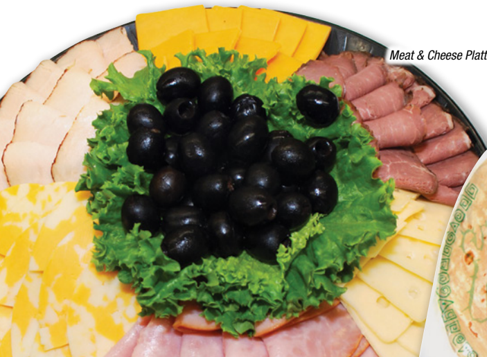
Meat & Cheese Platter